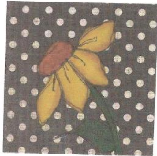
Sunflower Acid Paper Painted Sample