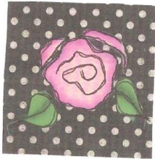
Rose Acid Paper Painted Sample