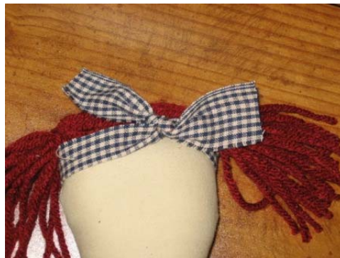
Cut excess ends from either bow that you tie