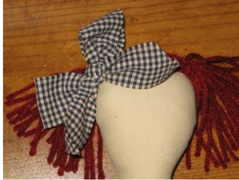
Cut off excess

6. Now, let's make a headband. The curly hair-do really looks cute with this but it was difficult to find a model with curly hair on such short notice so our ponytail model volunteered for the job. Ü