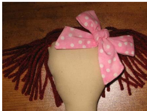
Finished regular bow (would probably look better on a larger doll's head)