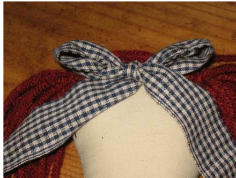
Tie regular bow