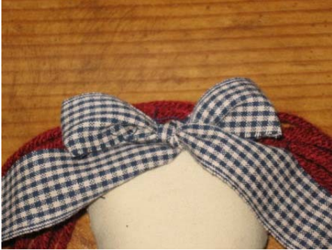
Tie regular bow

* Glue or sew to the desired location on the doll's head (or tie around ponytails or braids instead).