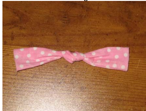
Mark cutting lines and cut to length

* Cut bow ends to desired length, turn raw ends in towards the center 1/4" and sew. No raw edges!