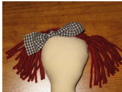
Finished glued bow