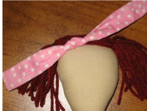
Turn right side out and estimate desired length

* Loosely tie as desired to get a general idea about how long you want the ends to be after tying. Cut ends leaving about 1/4" longer for turning inward to sew. Headbands and bows from pony tail or braids will need to be removed to cut and sew the length.