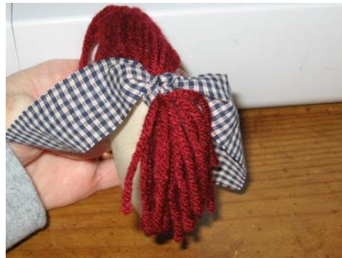
Tied Bow around pony tail (before cutting)