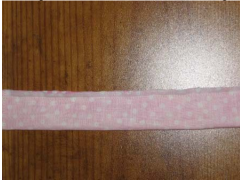
Sew right sides together

* Fold fabric in half lengthwise with right sides together and sew raw edges together using a 1/4" seam allowance. Turn right side out.