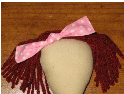
Finished Plain Bow

* Add to head or hair in desired fashion.