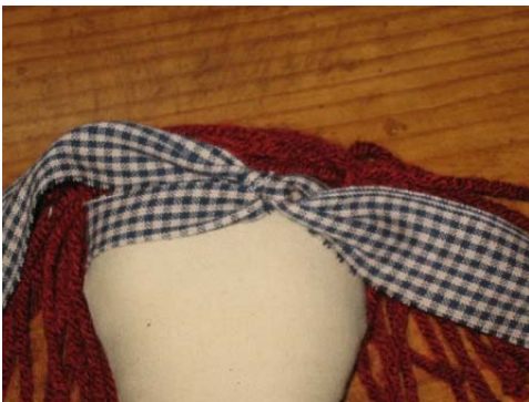
Or tie plain bow