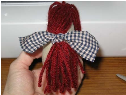
Finished pony tail bow