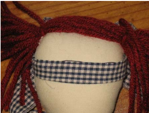
Back of headband (closer to the bottom of the head looks better).

*Wrap around the doll's head. Sew or glue the back in place. Either tie in a knot or tie in a regular bow on top of doll's head. Cut excess ends. Glue or sew bow itself to the desired location on the doll's head.