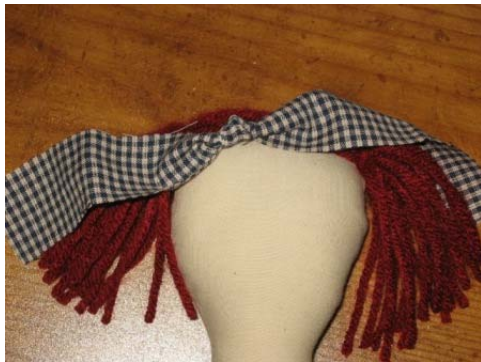
Tied Bow to glue to head (before cutting)