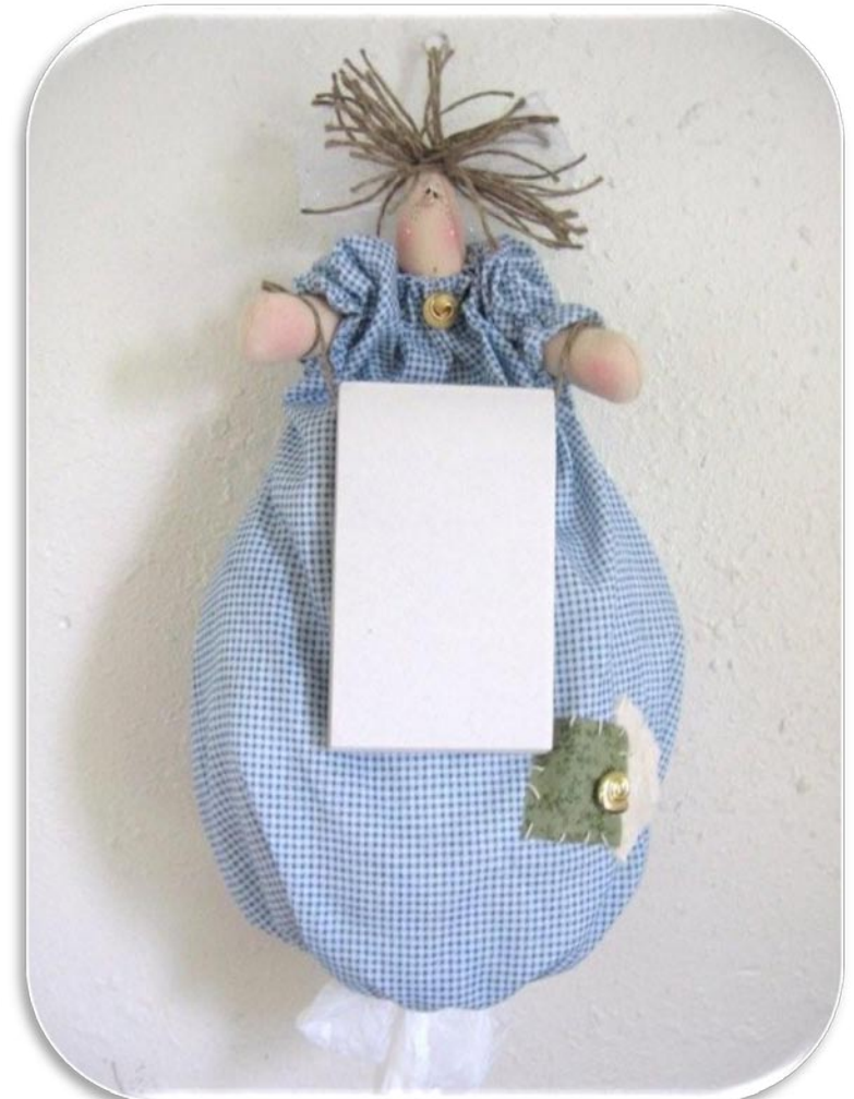
#151E 13" Note Pad Bag Angel

Deena's Country Hearth dolls can be made for fun or profit but cannot be massed produced without permission. No reproduction of pattern in any way can be done except for personal use..Country Hearth is not responsible for human error when making these dolls. This is an E-pattern and cannot be resold in any way. Email: Dee@DeenasCountryHearth.com