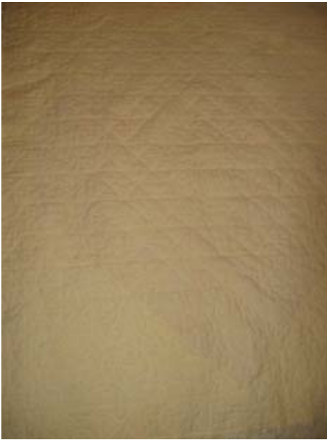
Finished back has a quilted diamond pattern