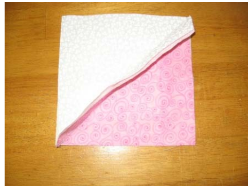
Add squares (regular squares or those made from triangles)