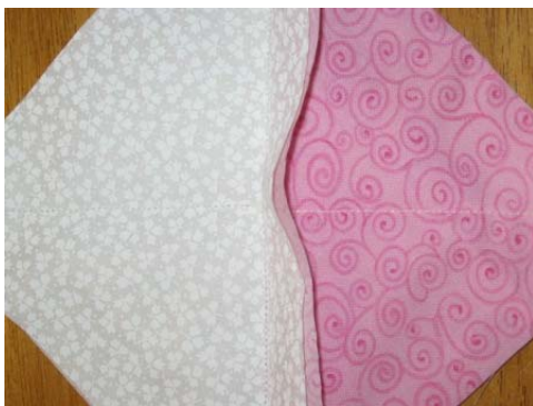
X sewn onto triangles