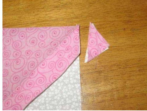
Cut off excess overhang