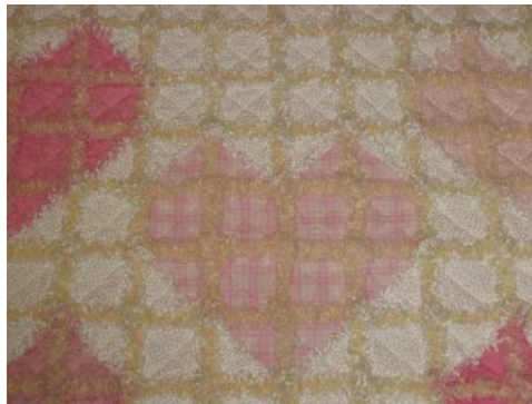
A few close up pictures