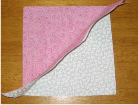
Sew triangles together