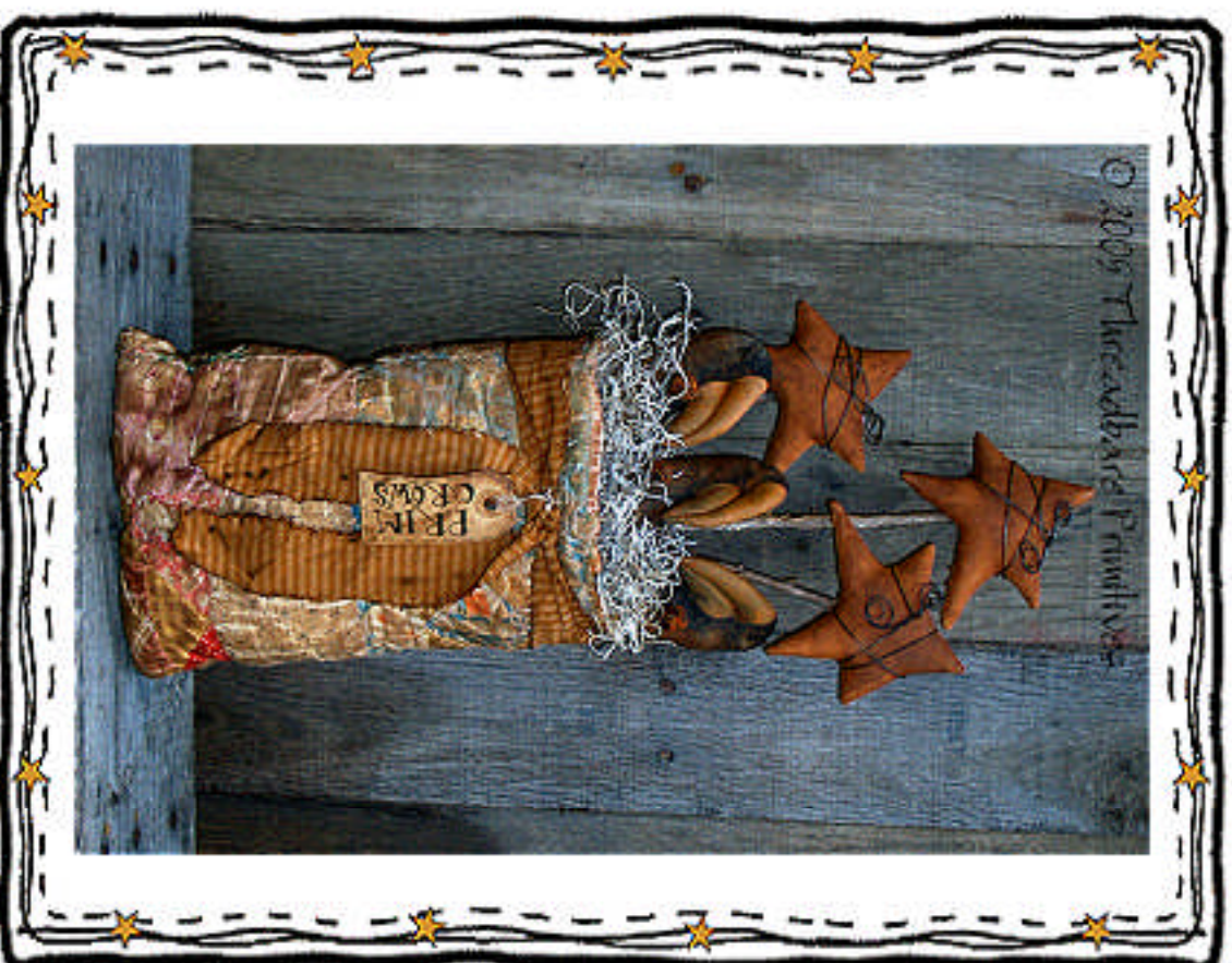
#156 Primitive Sack of Crows and Stars