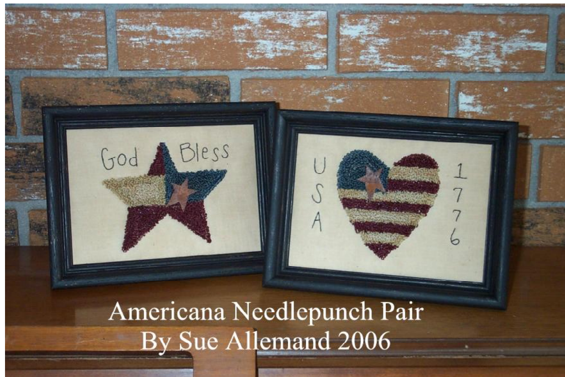
Americana Needlepunch Pair By Sue Allemand 2006